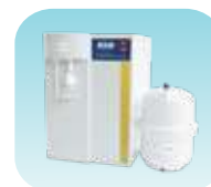
Water purification system