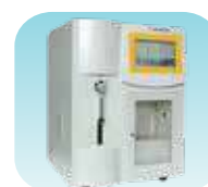
Liquid Partical Counter